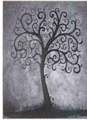
There are many paths to a "good life"

The GLM is designed to be unique for each person as everyone has different needs and goals. It focuses on the human being with the idea that by helping a person get his needs met in a healthy way, he no longer has to get his needs met in an unhealthy way, such as through offending. It makes sense that a person will be more motivated, make changes, and become healthy with this treatment focus.